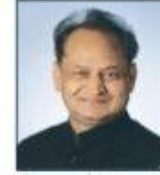
अशोक गहलोत, मुख्यमंत्री